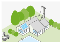
Residential grid-tie solar with backup power